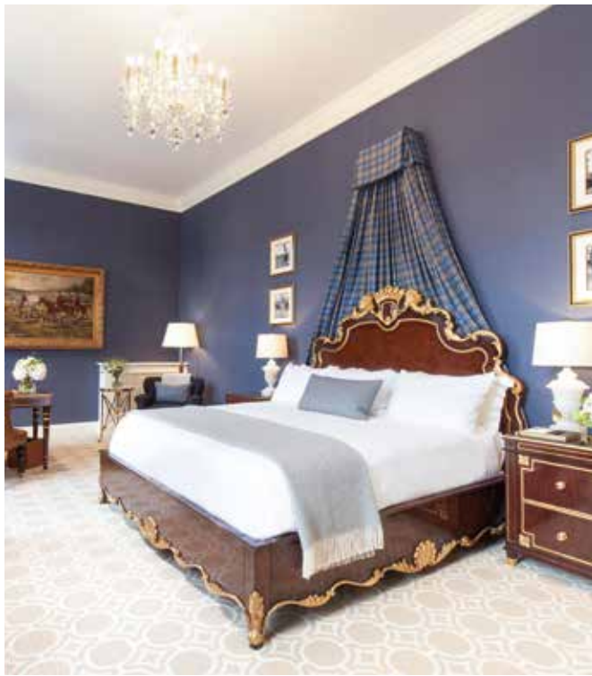
TRUMP TURNBERRY'S GUEST BEDROOMS ARE ALL FURNISHED TO THE SAME EXQUISITE LEVEL