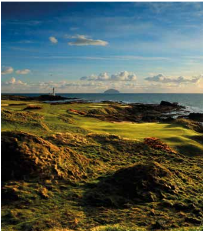
PLAY TURNBERRY'S CHAMPIONSHIP LINKS

LOCATED ON THE RUGGED AYRSHIRE COAST, TRUMP TURNBERRY, A LUXURY COLLECTION RESORT, SCOTLAND HAS OVER 100 YEARS OF HERITAGE AND HISTORY; IT IS AN ICONIC DESTINATION KNOWN THROUGHOUT THE WORLD.