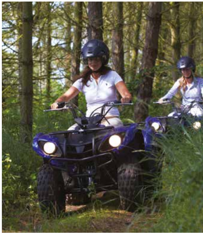
RACE ALONG RUGGED TERRAIN AT TURNBERRY ADVENTURES

Lavish and luxurious, Trump Turnberry's guest rooms are a true indulgence. Furnished to the highest standard, each room reflects the indigenous nature of the resort and its rich history. Four signature suites are available, or alternatively retreat to the opulent surrounds of The Turnberry Lighthouse Suite, a peaceful haven from the bustle of day-to-day life. The Trump Villas are also located just a short chip from the Clubhouse.